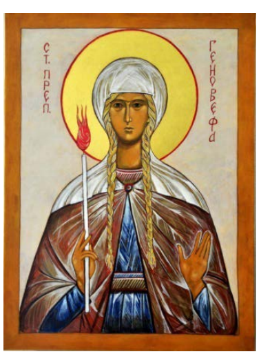
Icon of St Genevieve of Paris

St. Procopius, abbot of Sazava in Bohemia (September 16/29; 1053)