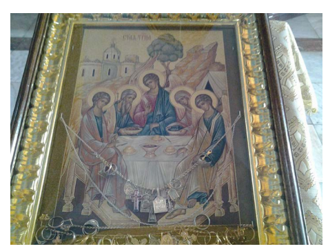
Icon of the Old Testament Trinity

On the first floor of a Gothic building in all that remains of a large Crusader church built to commemorate the Dormition, there is situated the Hall of the Last Supper or Coenaculum. This is believed to be over the site of an earlier building that was the location of the Last Supper. Some scholars however, believe that the true site is a small room beneath St Mark's Church in Ararat Street. Back at Bethlehem there