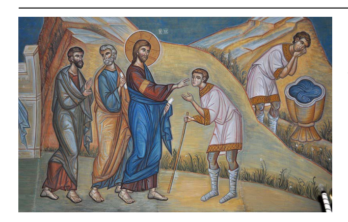
Healing of the blind man. Fresco at the Optina Pustyn Monastery

soul and intellect, but also his body. If death is a consequence of sin (cf. James 1:15), an illness may be seen as a situation between sin and death: it follows sin and precedes death. It is not, of course, that every particular sin results in a particular illness. The real issue concerns the root of all illness, namely, human corruptibility. As St Symeon the New Theologian remarks, 'doctors cure human bodies... but they can never cure the basic illness of human nature, its corruptibility. For this reason, when they try different means to cure one particular illness, the body then falls prey to another disease'. Human nature, according to St Symeon, needs a physician who can heal it from its corruptibility, and this physician is Jesus Christ Himself.