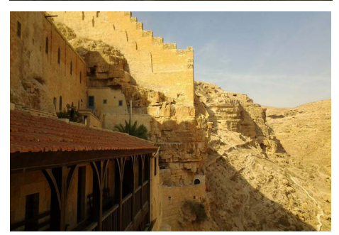
St Sabbas Monastery