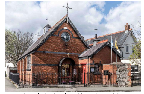
Greek Orthodox Church, Dublin